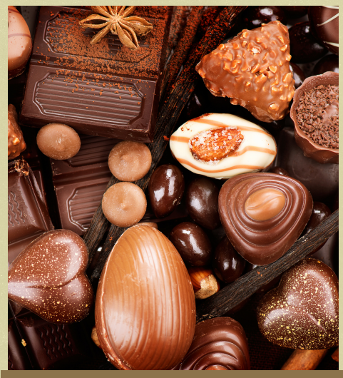
Sweets and Chocolates